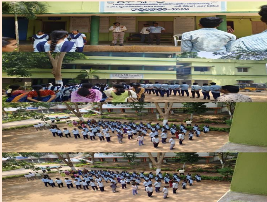
Students and Staff at General Assembly