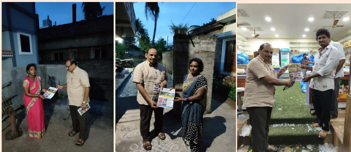
Admission Campaign by Staff in and around Ravulapalem